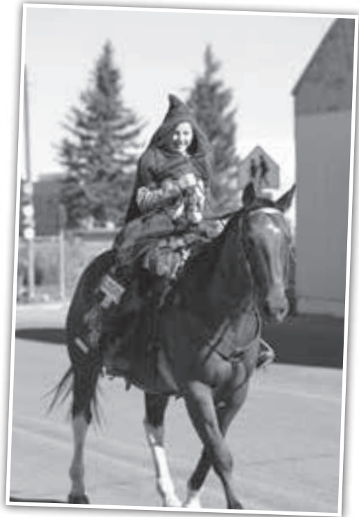
Homecoming Parade Losing is 🐄🐄