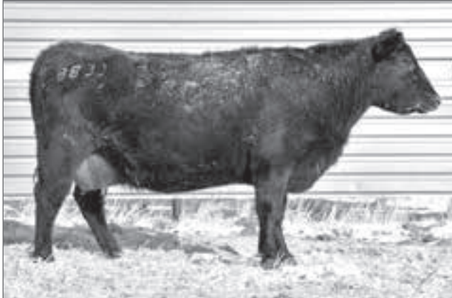
Dam of Lot 6. She is doing a excellent job for us. Picture was taken just after she calved this year.