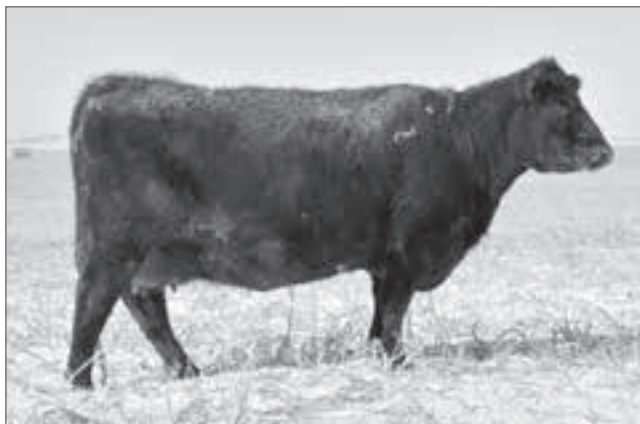
Dam of Lot 2 just after she calved this year. She is the kind of cow we strive to produce.

He is a thick made and moderate framed, good footed, and deep-bodied bull. Has a very balanced EPD profile. Ranks top 10% for $M, 15% $W, 20% HP, 25% for both WW and YW. His dam comes from a very solid cow family for us. She is very moderate framed, good udder, with excellent feet. She calved AI again this year.